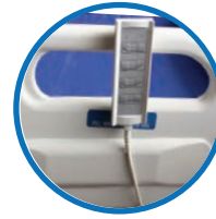
PATIENT HAND CONTROLLER