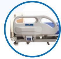
4 LUXURY SIDE RAILS