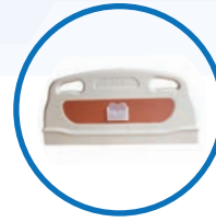
DETACHABLE HEAD/ FOOTBOARD