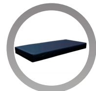
10 cm high density foam mattress