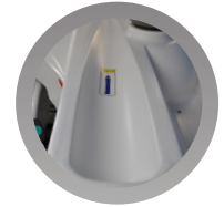
Oxygen tank holder