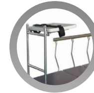
Monitor shelf / Defib. table *optional