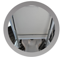
Hydraulic CPR release