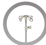
IV pole with four hooks