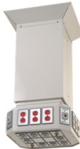
Pneumatic Retractable Type