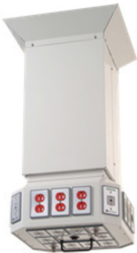
Manual Retractable Type