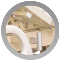
Bed frame cold-rolled steel tube