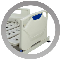
Detachable ABS head and foot board