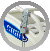
Patient hand controller