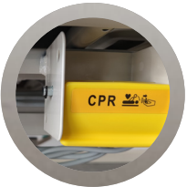
CPR quick release back board