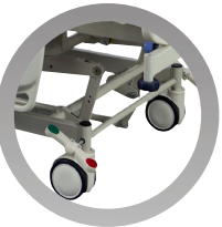
Universal silent wheels with central brake system