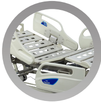
4 pcs ABS big guard rail