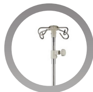
IV pole with four hooks