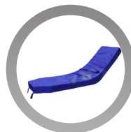
High density sponge mattress