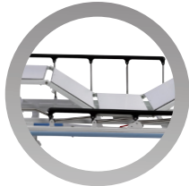
Collapsible side rails