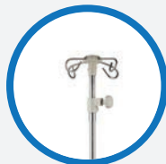
IV POLE WITH FOUR HOOKS