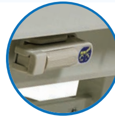
SINGLE CRANK SYSTEM