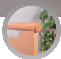
Premium wooden headboard & footboard