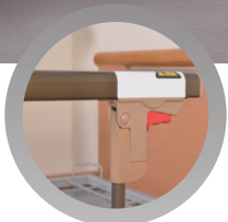
Collapsible aluminum side rails