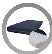
High density sponge mattress