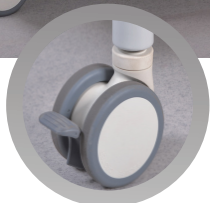
Noiseless dual castors