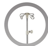
Stainless steel IV pole