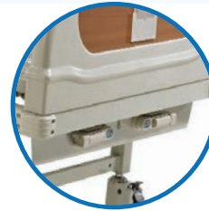
DUAL CRANK SYSTEM