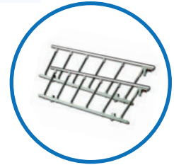
COLLAPSIBLE TUCK AWAY SIDE RAILS