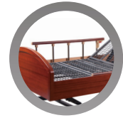
Collapsible tuck away side rails