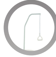
Lifting pole (optional)