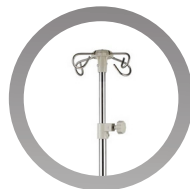
IV pole with four hooks