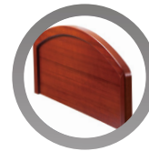
Detachable wooden head & foot boards