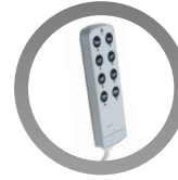
Patient hand controller