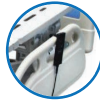
PATIENT HAND CONTROLLER