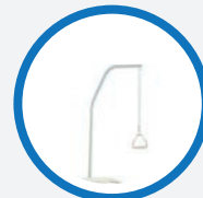
LIFTING POLE (OPTIONAL)