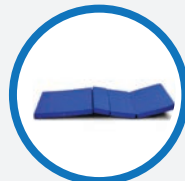
HIGH DENSITY FOAM MATTRESS