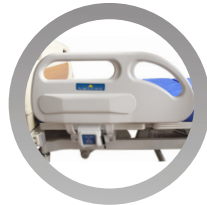
4 luxury side rails