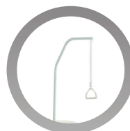
Lifting pole (optional)