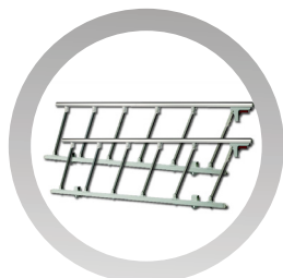
Collapsible tuck away side rails