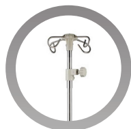
IV pole with four hooks