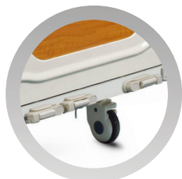
Triple crank system